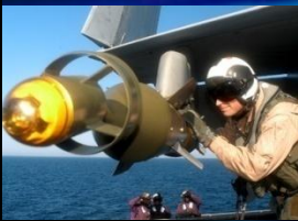
1964 Laser Guided Weapons